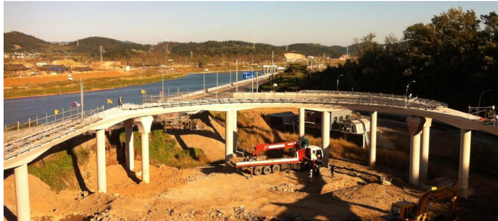
View of the track loop from the control room

The vehicles are electrically powered via a 500 VDC current collection system for high performance and continuous operation throughout the day. Once the vehicles are in operation, this system will provide quiet, comfortable and eco-friendly transport for the three million annual visitors to the reserve.