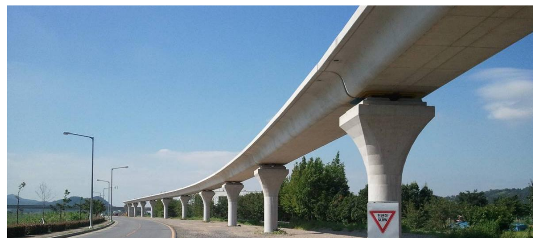
The main guideway to Station Two

Forty vehicles will operate along five kilometres of elevated, double tracked guideway.