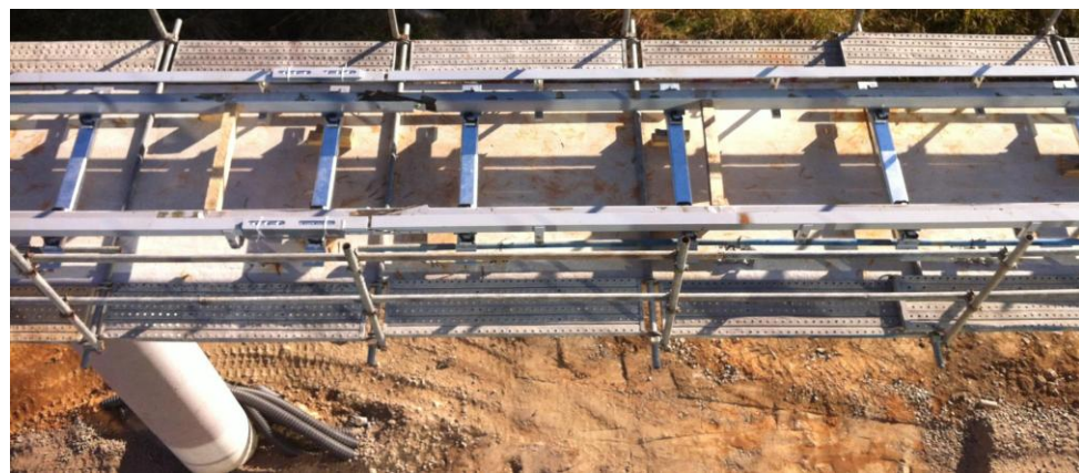
Steel track being laid onto the concrete guideway

Station Two is currently under construction and due to be completed by the end of December 2012. Both stations will feature in-line berths, platform screen doors and touch screen passenger information/destination selection facilities.