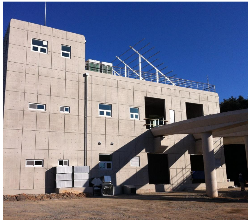
Exterior views of the control room and depot

The depot sits opposite Station One at the Suncheon City end of the system. A vehicle storage facility is situated on the ground floor of the depot. Daily and heavy maintenance takes place on the first floor with two off-line spurs to guide the vehicles in.